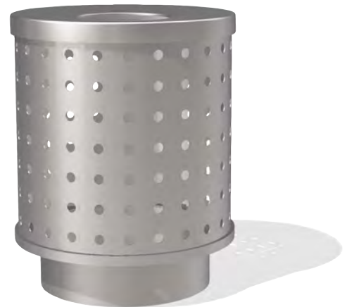
30 GAL TRASH RECEPTACLE - TLTR30