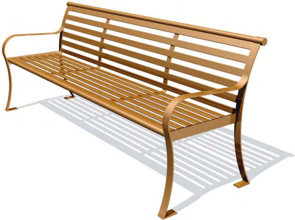
HERITAGE 6' HORIZONTAL SLAT BENCH WITH BACK AND ARMS - HEBA6H MIDDLE ARM/VANDAL BAR AND OTHER LENGTHS AVAILABLE