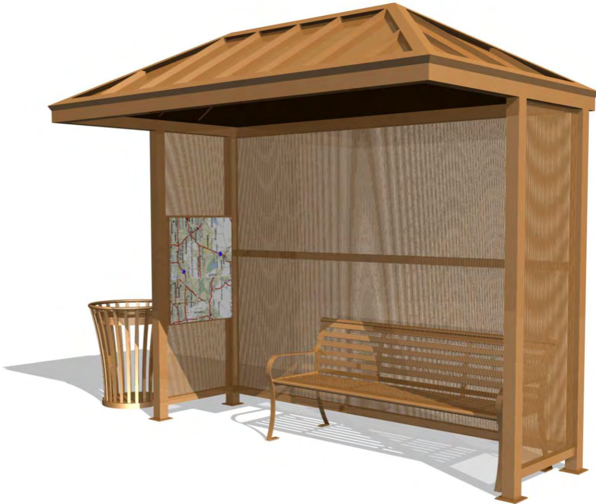
HERITAGE 10' SHELTER WITH BACK SCREEN - HE10BS