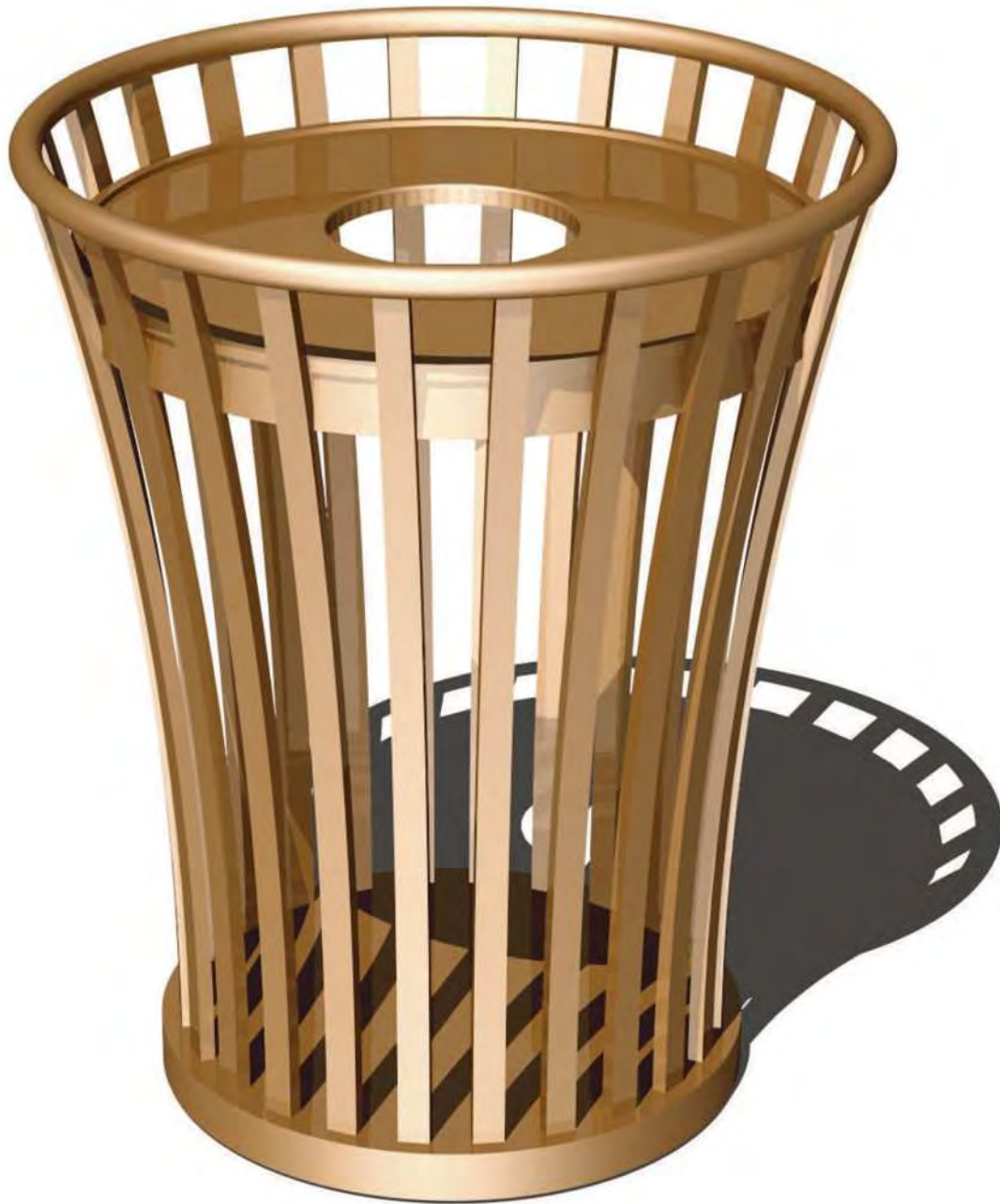
HERITAGE 30 GAL CURVED SLAT TRASH RECEPTACLE - HETR30