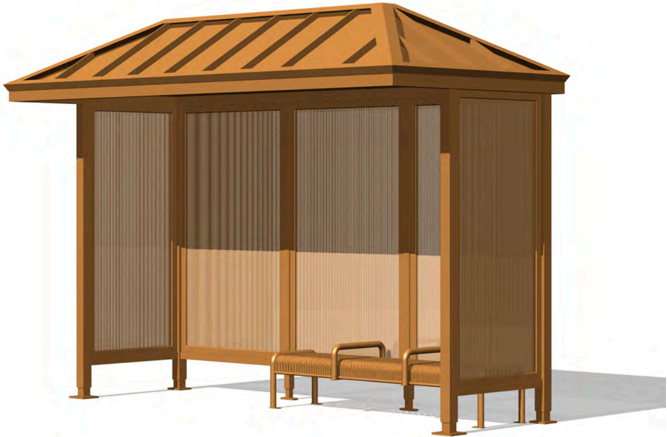
HERITAGE 12' SHELTER WITH BACK SCREEN - HE12BS SHOWN WITH 6' OASIS BENCH WITH VANDAL BARS [OASB6-2VB]