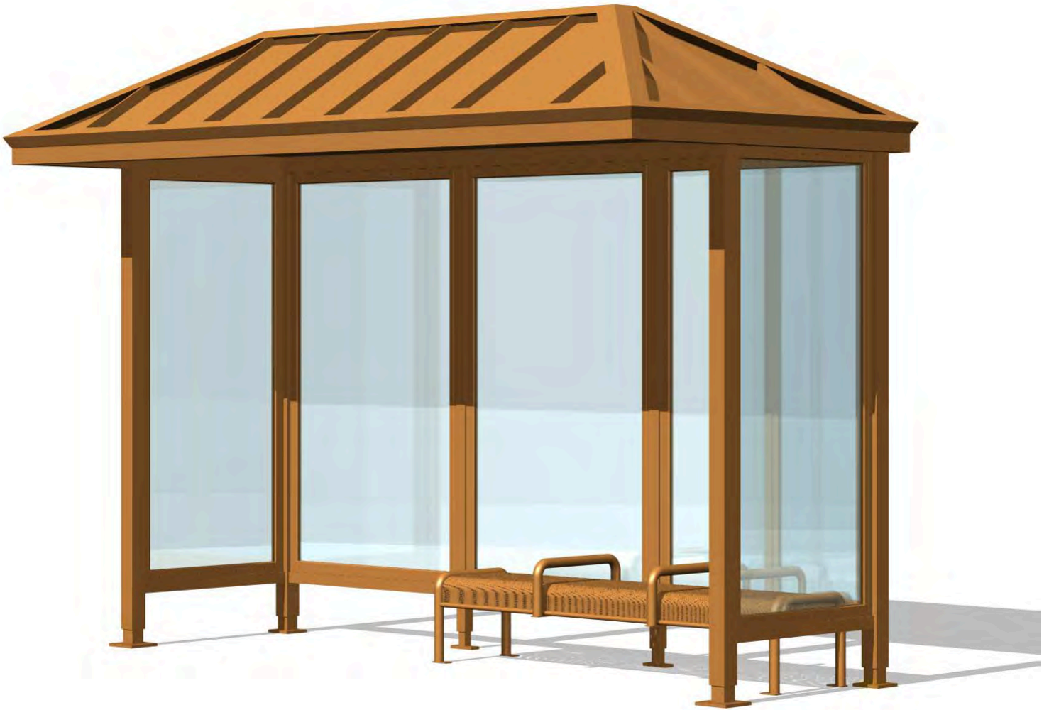
HERITAGE 12' SHELTER WITH GLASS - HE12BS-GL SHOWN WITH 6' OASIS BENCH WITH VANDAL BARS [OASB6-2VB]