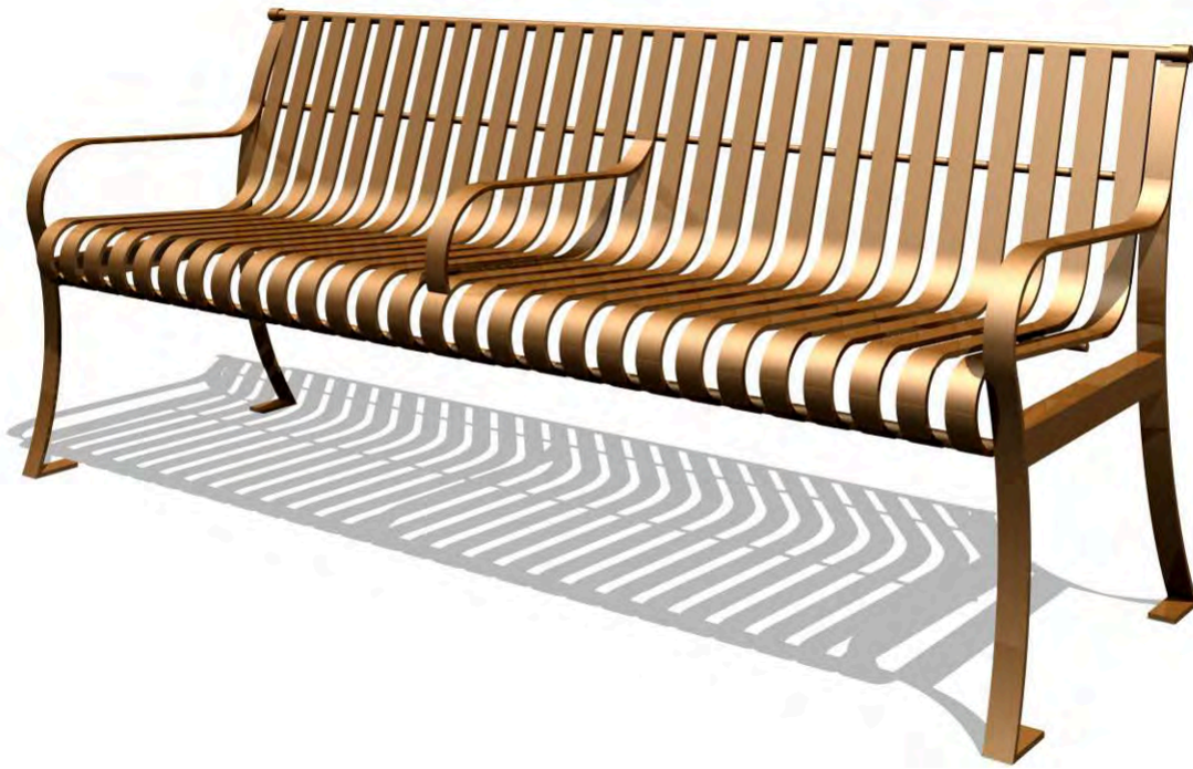
HERITAGE 6' CURVED SLAT BENCH WITH BACK AND ARMS - HEBA6V INSET SHOWS OPTIONAL MIDDLE ARM/VANDAL BAR • OTHER LENGTHS AVAILABLE