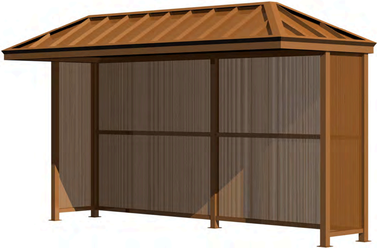
HERITAGE 15' SHELTER WITH BACK SCREEN - HE15BS